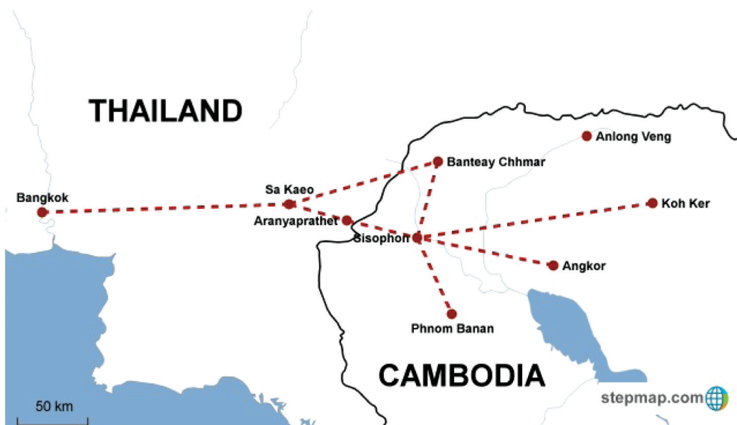
FIG. 2 Trafficking routes in the ‘Channel 1’ network.