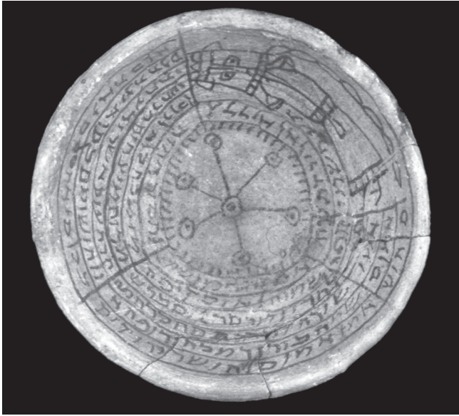
Figure 11.1. Aramaic incantation bowl (BM 103359, Segal 2000: 033A), ca. A.D. sixth–eighth century, top view of the bowl's interior (diameter: 14 cm, depth: 6.3 cm) © Trustees of the British Museum.

and country of origin are crucial to the following discussion of provenance and the Schøyen collection.