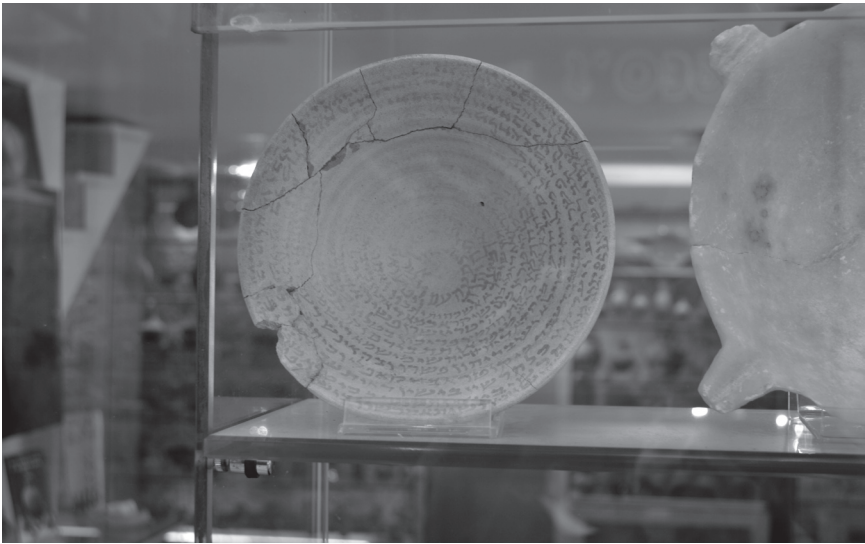
Figure 11.3. Incantation bowl for sale in Antiquities Shop, Jerusalem.

goods in and out of Iraq. The embargo applied to antiquities as much as to any other class of material, although between the 1990s and early 2000s a seemingly uninterrupted flow of artifacts (including incantation bowls) out of Iraq onto the international market was evident (Brodie 2006; Lawler