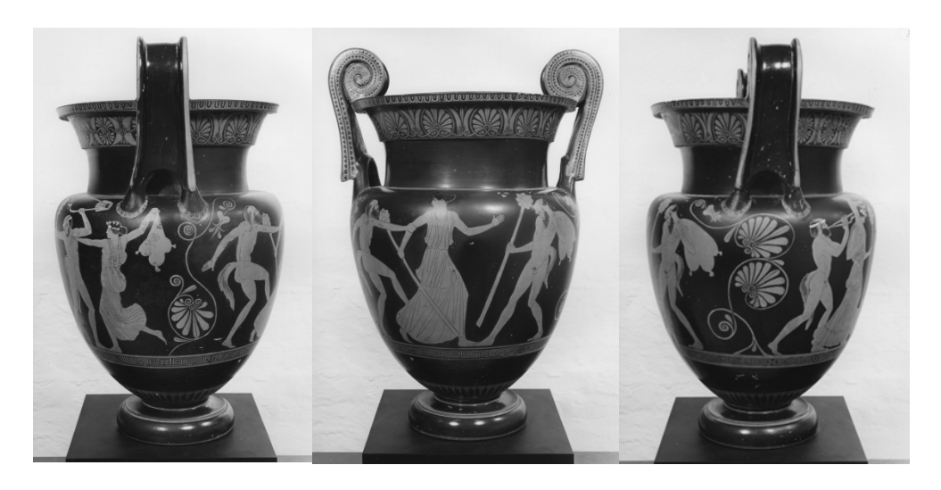
Figs. 5-7: The krater as depicted in three professional images in the confiscated Symes–Michaelides archive.

(Figs. 5-7), there is no image in this archive depicting the front side of the vase (shown in the Mia website); however, its identity can be deduced by comparing these images with the three from Medici (Figs. 2-4 above). From experience of other cases involving museum acquisitions from Symes-Michaelides, I find it probable that the Mia owns a Symes-Michaelides image of the front of the vase, since it was standard practice for dealers proposing a sale to send the best image of the object, and if a museum decided to purchase an object, they kept the image.