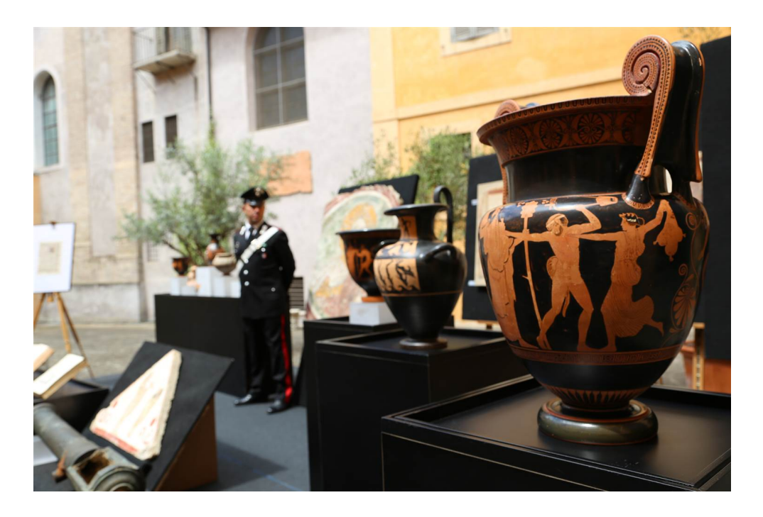
Fig. 8: The krater (right) as presented in Rome after its repatriation from Minneapolis.

This case of the krater highlights the delay being exercised by institutions involved in the acquisition of illicit antiquities in the post-1970 period (contra the relevant 1970 UNESCO convention, see UNESCO 1970). The reasons for this tactic are to avoid losing the artefact they own and the money paid for its acquisition; but they have to choose between the negative publicity generated because they keep holding onto an illicit antiquity, or the negative publicity that will be generated by the verification of their involvement, mixed with an immediate positive public reaction to news of the institution's decision to return the antiquity/(-ies). It took 6 years for the Minneapolis Institute of Art to admit that the krater was illicit and 10 to