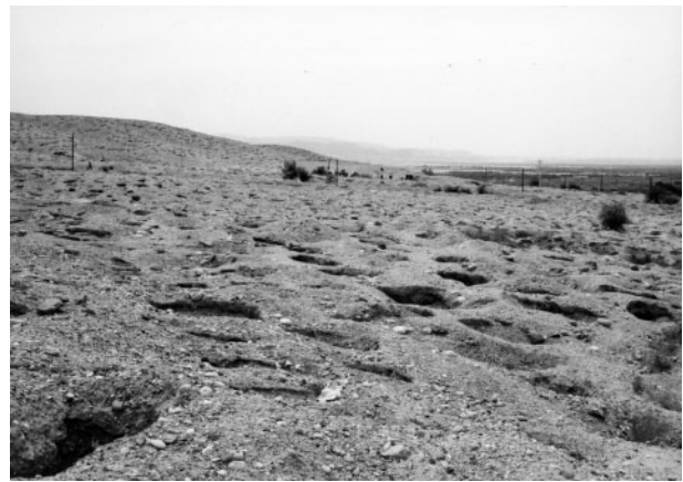
Figure 3 Bāb adh-Dhrā'/Qazone in 2004 showing pitting.

These estimates of the amount of material looted from Bāb adh-Dhrā' represent formidable figures, and the high estimate in particular seems suspect. There is no reason to believe that rich Cemetery A type tombs were found across the whole cemetery area. Cemetery C types might have been more widespread than is evident from the excavated areas. There is no guarantee either that all the looting pits penetrated burial chambers, though it seems most likely that pitted areas do represent looted tombs. Looters would not dig extensively in sterile areas, particularly if they were using long probing rods to locate chambers. A mean estimate of 18,725 pots—