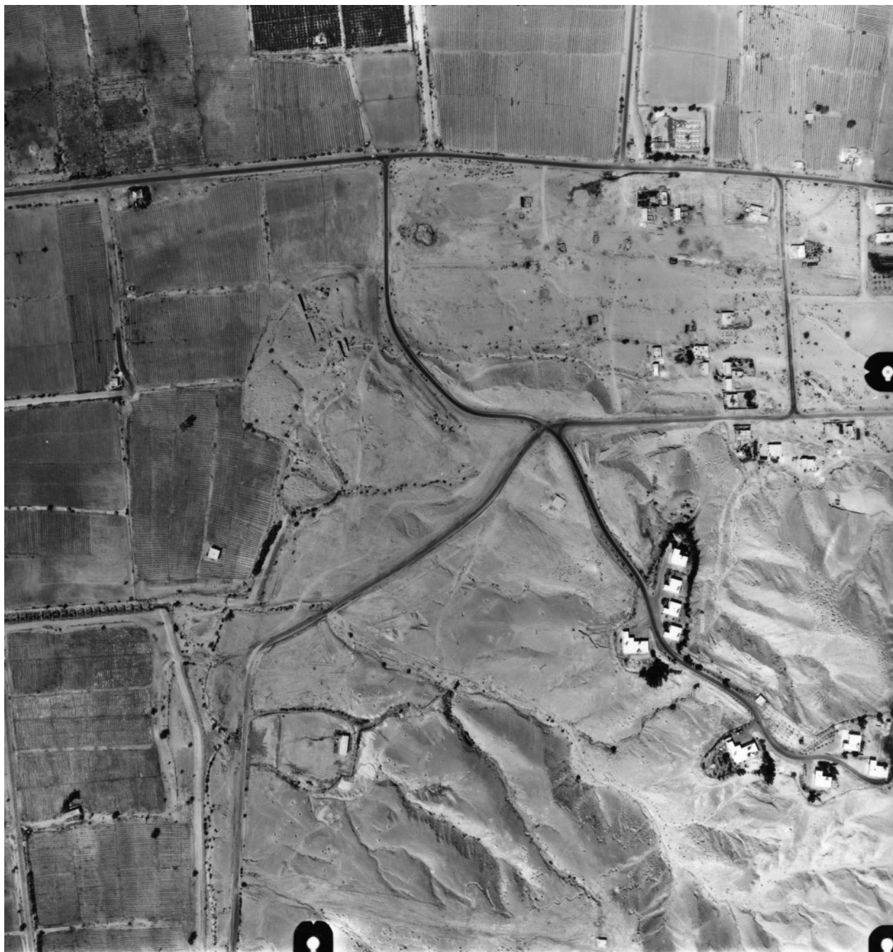
Figure 4 Aerial photograph of Safi in 1992.

expertise-intensive steps of image acquisition, processing, and ground truthing. Its use could multiply the number of individuals and agencies carrying out such monitoring and produce a large quantity of reliable information to feed into the heritage management policy-making process.