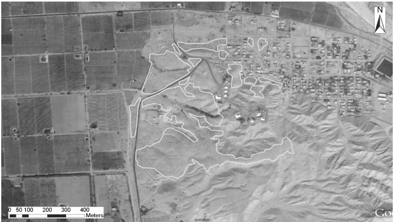
Image downloaded from Google Earth Pro 4 Aug 2008. Digital Globe Image, Catalog ID 101001000356B503, 20 Oct 2004.